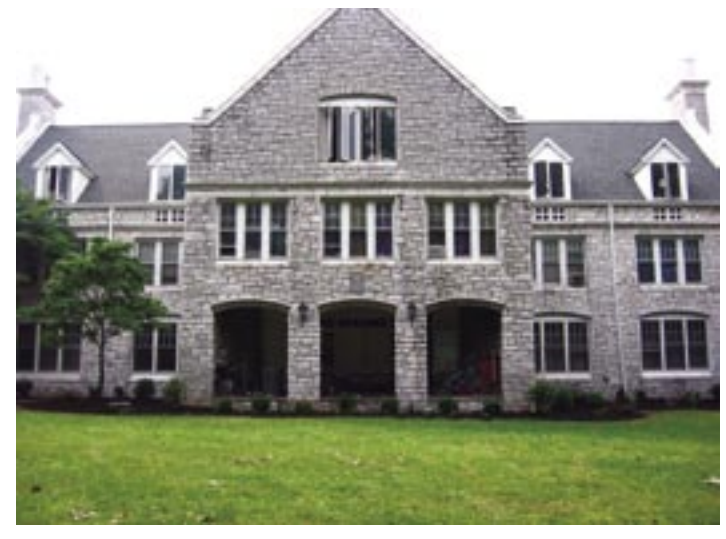
The new landscaping, viewed from the front.

Our annual retreat was also held at the beginning of the fall semester. Used as a way to get out of the Chapter Room, the undergraduates and several alumni all met in Lederer Park to discuss new positions within the house, Chapter organization and other general issues usually not detailed in a typical Chapter meeting.