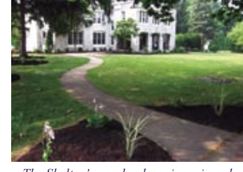
The Shelter's new landscaping, viewed from the side of the house.

The volleyball team is itching to play again after losing the championship by one point in overtime last year. Overall, everyone is looking to take their game to the next level but, more important, to just have fun.