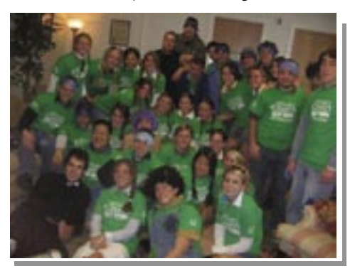
The undergraduate brothers and the sisters of Delta Zeta before their Greek Sing performance.

Fall was very successful academically as well. The Chapter received a cumulative grade point average of 3.23, ranking them sixth in the Interfraternity Council. We were 0.2 points above the university's all-male average of 3.03.