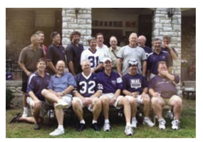
Class of 1982

With the year off to a great start, and hopefully with more promising things to come, the Tau Chapter undergrads look forward to homecoming this year and getting to see the handsomely aged faces of our alumni. A new-found sense of pride fills this house as we continue to flourish in a variety of ways around campus, and we look forward to continuing to improve.