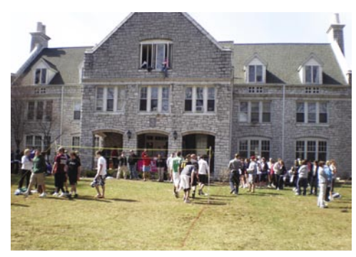
The annual Zeta Spikes was held at the Shelter again this year.

Delta Zeta. For those of you who receive The Rainbow, you can see in the most recent edition that we are the #1 chapter in the nation for philanthropy by almost 10 times over.