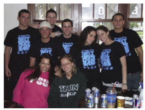
Delt brothers and Delta Delta Delta sisters joined together for the Delt Rockband Philanthropy.

The Delts raised just over $69,000 for THON 2008 with our partners, the sisters of