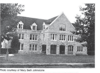
... AND THE DELT HOUSE AS IT STANDS TODAY.

After becoming brothers of Delta Tau Delta, the new Delts began looking for a place to build a house of their own. In 1925 Tau corporation purchased six lots on the corner of Garmer street and Hamilton Ave. In 1927, construction of the house began and in 1928