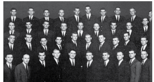
The Tau Class of 1960 invites you to an all-era reunion on September 11.

Twenty-five rooms have been reserved at the Nittany Lion Inn. The cost per night is $119 plus tax (a two night stay is required). Free parking is available at the Inn with additional free parking at the University-owned garage