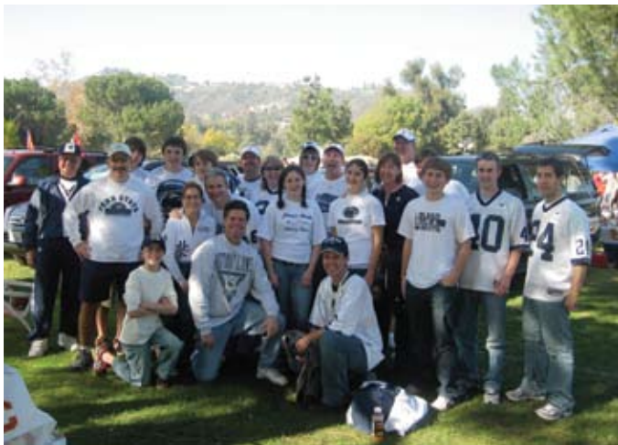
Join Us for a Tau Tailgate for Blue White on April 24!

To showcase all our improvements to the Shelter, the current Penn State Delts and the members of the Tau Company Board would like to invite you to a Pig Roast Tailgate at the Shelter before the Blue and White Football