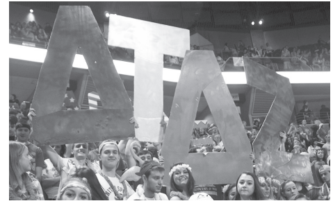
DTD and Delta Zeta supporters cheer from the stands of the Bryce Jordan Center.

As the weekend drew to a close, parents could be seen holding tightly to those