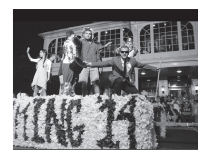
Tau Delts enjoy their drive down College Ave. on their "Wizard of Oz" 2014 Homecoming float.

As the semester draws to a close, I take this opportunity to thank everyone for the support given to the chapter during the 2014 year. Enjoy the holiday season and make a New Years' resolution to be more involved with our chapter in 2015!