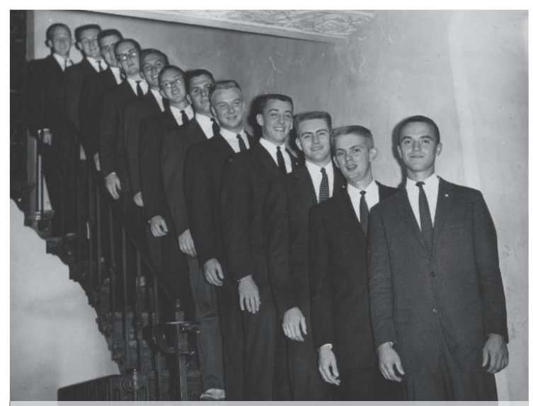
The Delta Tau Delta National Fraternity featured this Throwback Thursday photo recently on Twitter — the 1956 Tau Delt pledge class.

We mourn their passing and extend our condolences to their families and friends.