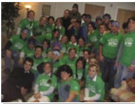
The undergraduate brothers and the sisters of Delta Zeta before their Greek Sing performance.

Fall was very successful academically as well. The Chapter received a cumulative grade point average of 3.23, ranking them sixth in the Interfraternity Council. We were 0.2 points above the university's all-male average of 3.03.