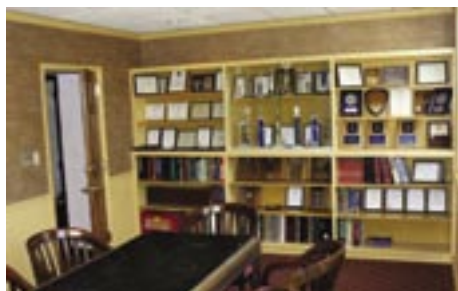
The Pritchard Library following renovation.

One more project can be marked as completed at the house. Almost 20 years ago,