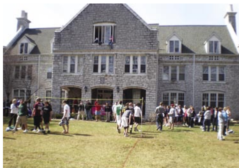
The annual Zeta Spikes was held at the Shelter again this year.

Delta Zeta. For those of you who receive The Rainbow, you can see in the most recent edition that we are the #1 chapter in the nation for philanthropy by almost 10 times over.