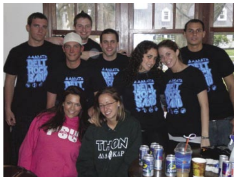
Delt brothers and Delta Delta Delta sisters joined together for the Delt Rockband Philanthropy.

Next fall we plan on having an alumni dinner, other than Homecoming, in either September or November to allow you to better acquaint yourselves with the new members of our Chapter and to show you, in person, some of the strides our Brotherhood has taken.