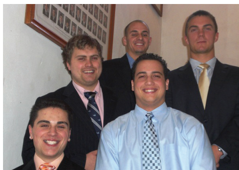
The current undergraduate officers.

There are several improvements that the shelter truly needs and we need your help! See page 4 for a sneak peek, and watch your email and mail for details on Tau Chapter Capital Campaign II (or CCII). Phil Lucas '83 and the other board members are working hard on the plans to kick start a new fundraising initiative. We are investigating other means of giving that may make it easier on everyone's budget, yet still provide the support that the shelter so badly needs. Please help us repair and replace the dining room floor, or restore the grand Brother Staircase. The kitchen needs a new exhaust hood and other new equipment as well. The first capital campaign was successful and provided the funding needed to renovate all of the bathrooms, new hallway flooring, create the new grand foyer, and install new windows, roofing, sprinkler and mechanical systems upgrades and library renovations. Please help continue the success, pave the way for the future generation of Delts and give what you can. Thanks for listening. Go PSU!