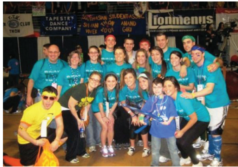
Delta Tau Delta and Delta Zeta with the Moser Family at THON 2009.

The brothers of Delta Tau Delta have been on a roll lately. Most recently, we raised $101,600