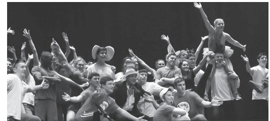
Delta Tau Delta, Gamma Phi Beta, and Kappa Delta Rho performed "Seussical!" for Greek Sing 2014. The performance won first place for best short performance.

As Tau President, I was selected to serve as the Administrative Vice President for 2014 Greek Sing and 2015 Greek Week. Go to https://www.youtube.com/watch?v=39eDWuZx-Qs to see a video of our Greek Sing performance. It's great to see Tau Deltas making a difference on campus!