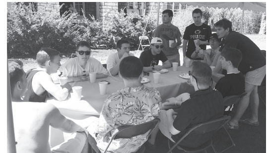
Undergraduates and Alumni Brothers celebrated Blue-White Weekend with a barbeque on the Shelter lawn.

Our Blue-White Alumni tailgate was a very nice event. Thank you to the Tau Corporation and other Alumni for participating in the weekend's events at the Shelter. We look forward to seeing you this fall.